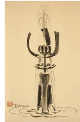
Title: Group Health Hospital Fountain Date: 1970 Primary Maker: George Tsutakawa Medium: Sumi ink on rice paper