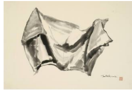
Title: Drapery Study Date: 1975 Primary Maker: George Tsutakawa Medium: Sumi ink on rice paper